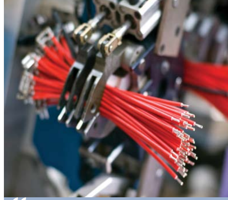
66 Innovative businesses can benefit from sitting on the committee responsible for creating particular standards.

Once involved, SMEs can gain additional benefit from being able to evaluate whether their participation was worthwhile. Standards bodies are working on a method for evaluation. They are also considering impact assessments, and a methodology to evaluate standardization projects, including the level of involvement of stakeholders.