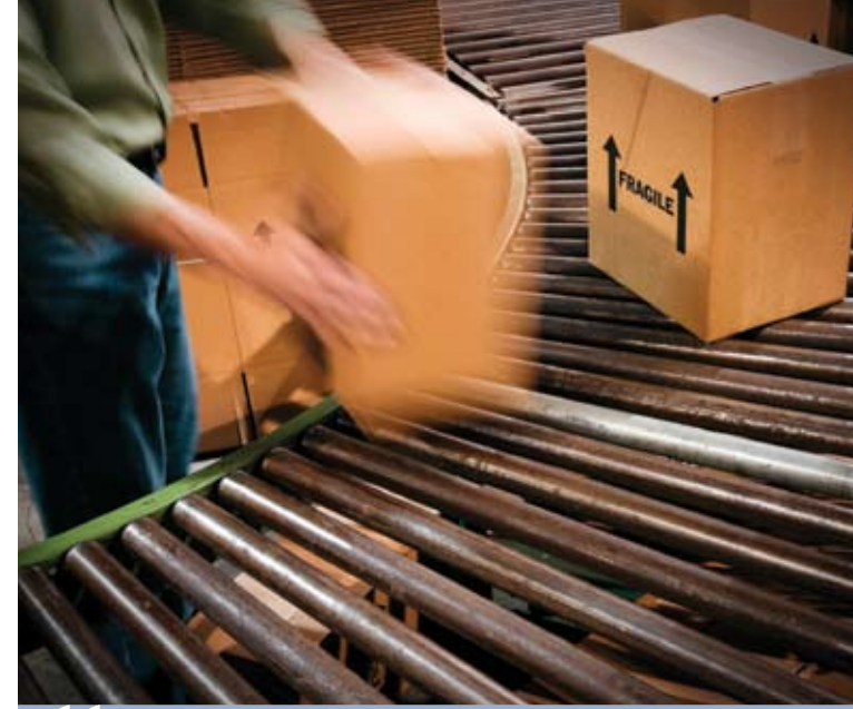
11 should be straightforward for smaller organizations to easily trace the most suitable standards for their business, and access all the information they need to make the most appropriate buying decisions.

In addition to search functionality, standards bodies are exploring other solutions to simplify the tracing of standards. This could include putting together sets of relevant standards for specific sectors, disciplines and types of organization. It could also include issuing press releases concerning new standards, targeted at particular groups. Bodies could even offer guidance for organizations on how to trace relevant standards. Trade associations could also be involved. informing members of standards relevant to their sector or discipline.